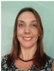
Secretary Support to the Finance Dpt. with sales settlements and payments