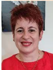
Administrative Secretary PMO Representative Human Resources