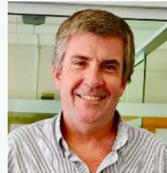
Administrative Assistant Imports, Accounting record and electronic invoicing