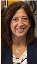
Financial - Administrative Manager