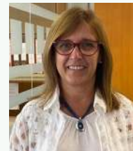
Administrative Assistant Imports, Accounting record and electronic invoicing