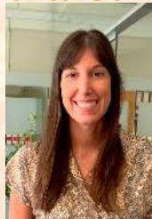
Management Secretary Reception and communication with clients